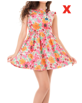
Mini-skirt Short Dress