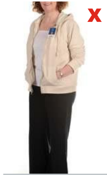
T-shirt Active Wear