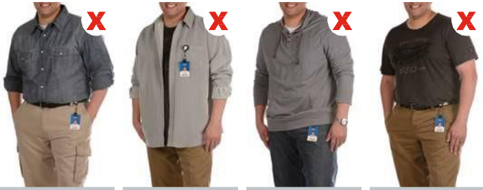
Denim Shirt Cargo Pants