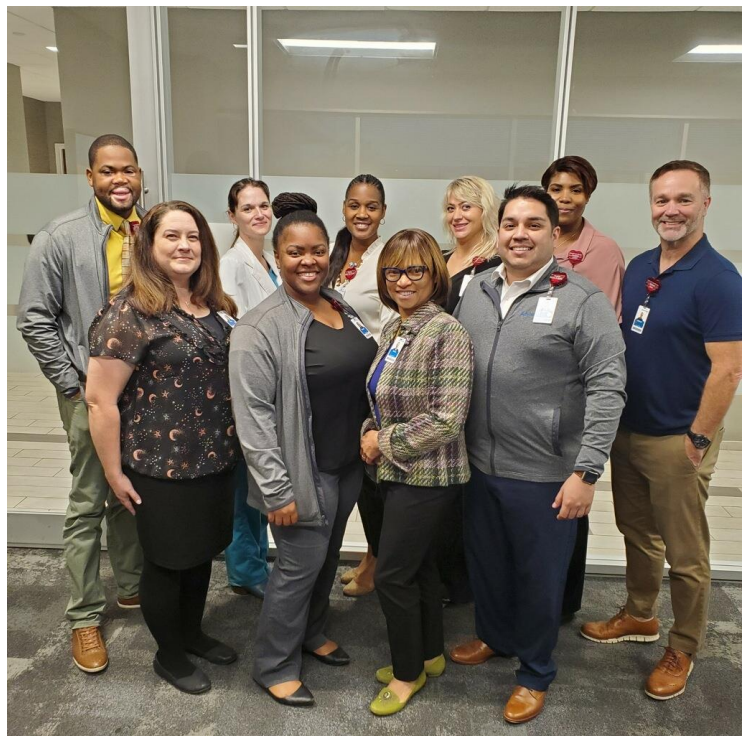
AdventHealth Community Care Team

*Total patients served for Orange, Osceola and Seminole County in 2019